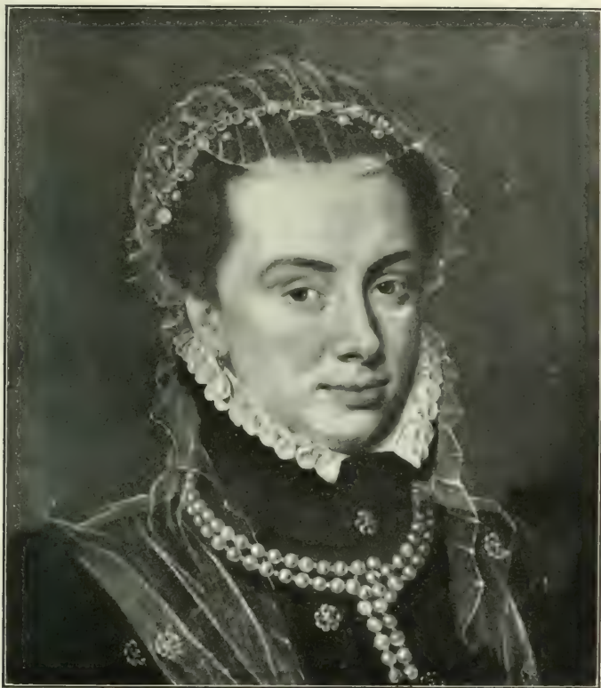
MARGARET, DUCHESS OF PARMA

After the painting by A. Moro of Dashorst. Imperial Picture Gallery, Vienna.